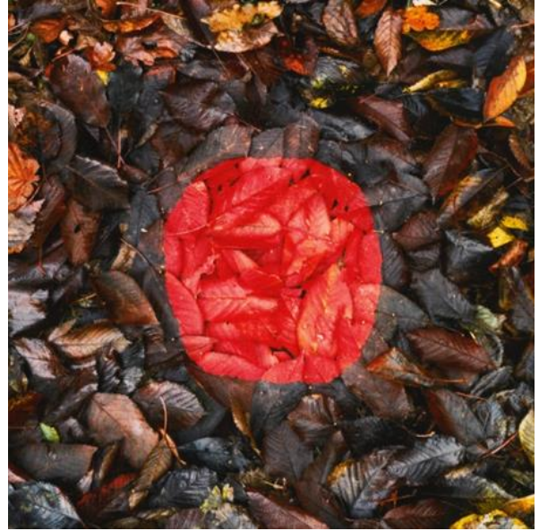
Springtime Andy Goldsworthy n.d.