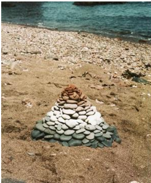
Beach Cairn Andy Goldsworthy 1987

See more of his work at: http://www.artnet.com/artists/andy-goldsworthy/7