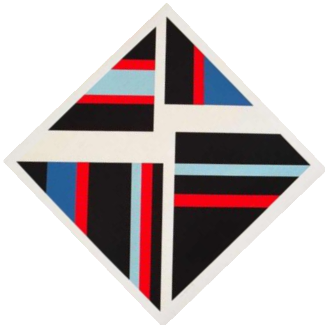
Black Diamond Ilya Bolotowsky c. 1970 <<<